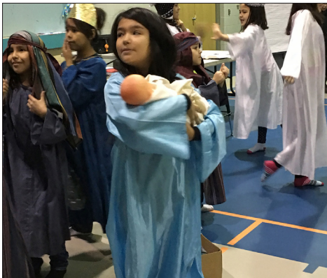
Acting out the Christmas story in Hall Lake, SK.

For unto us a child is born...Isaiah 9:6